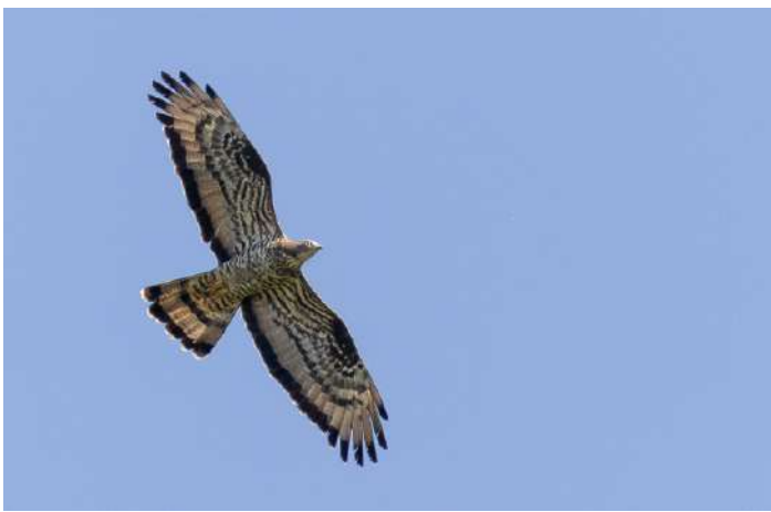
Migrating Honey Buzzard at Falsterbo

21 September. Birding in and around Falsterbo all day. Illustrated talk in the evening focussing on the migration over southern Sweden.