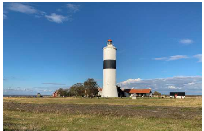
"Långe Jan" lighthouse at Ottenby, Öland

Copenhagen Airport where you will be picked up and left after the trip. It is possible to be dropped off for the return at Kalmar and pickup/drop-off in Malmö is also possible.