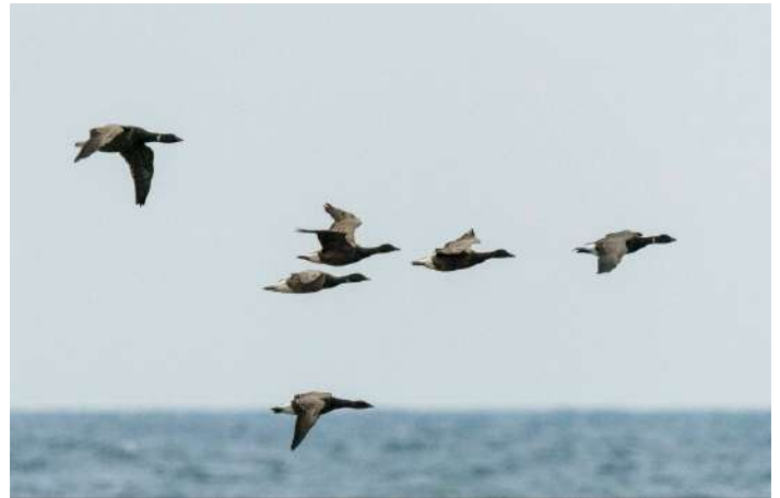
Brent Geese over the Baltic Sea

24 September. Morning birding depending on what more we would like to see and then drive to Öland (3.5 hours) with stops on the way. Lunch in Karlskrona. Evening birding on Öland.