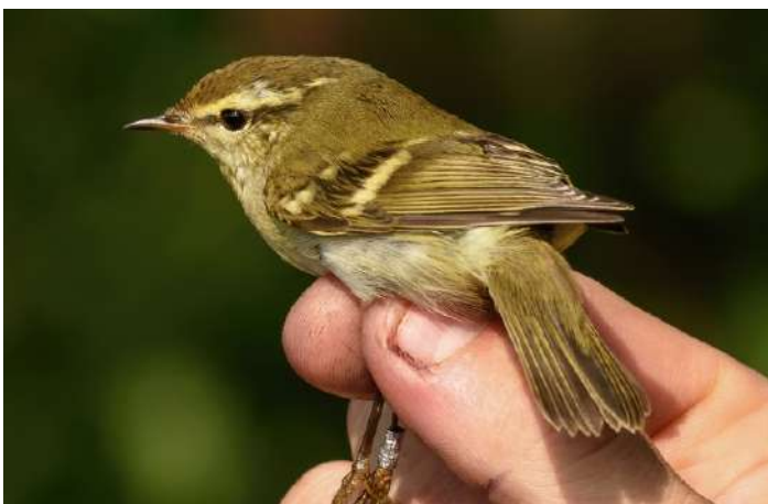
Yellow-browed Warbler at ringing station

23 September. We explore the Falsterbo peninsula all day, sites according to weather and birds.